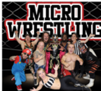
➤ MICRO WRESTLING PAGE 40