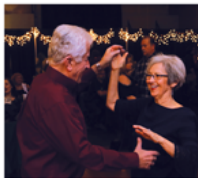
➤ DANCE MURFREESBORO PAGE 18