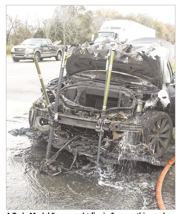
A Tesla Model S car caught fire in Smyrna this week.