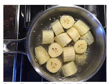
Diet Expert Tells All: "It's Like A Powerwash For Your Insides"