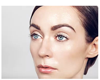
The Crazy Facial That Celebrities Say "Takes 10 Years Off" Your Face Sponsored | Hanacure on Town and Country Magazine