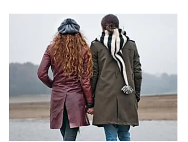
Can You Really Be "Just Friends?"