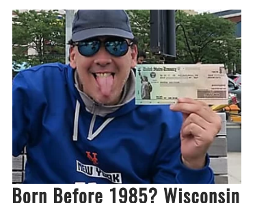
Will Pay Up To $355/Month Off Your Mortgage Sponsored | Smart Saver Online