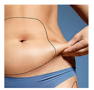
This Is What CoolSculpting Really Feels Like