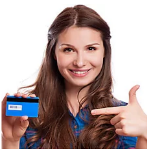
Here's What You Should Know About Balance Transfer Cards