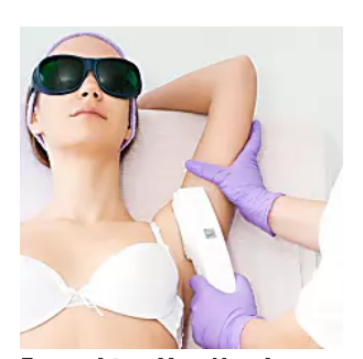
Everything You Need to Know About Laser Hair Removal