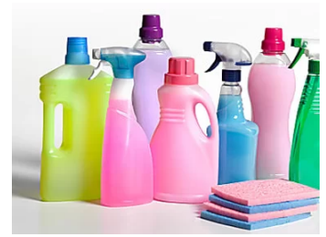
Think Again Before Cleaning Your House with These Harmful Products