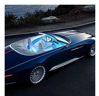
Incredible new 2018 Luxury Sedans Will Blow You Away