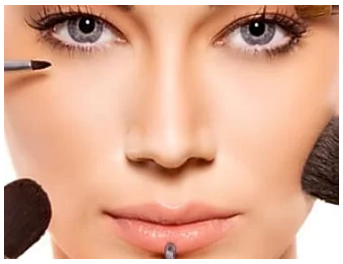
30 Must-Know Beauty Secrets