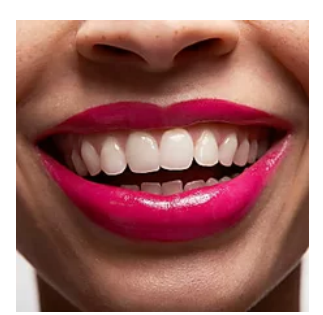
10 Things to Know Before Trying Invisalign