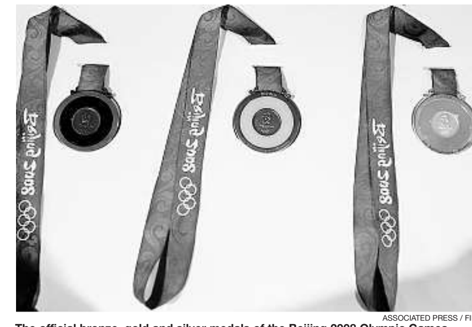
The official bronze, gold and silver medals of the Beijing 2008 Olympic Games.