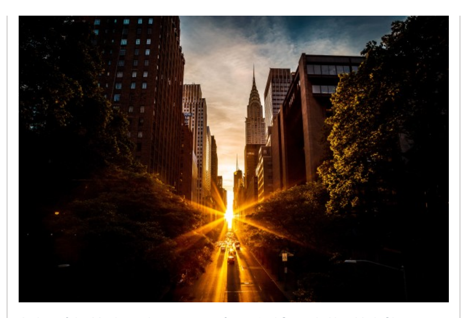
A view of the Manhattanhenge sunset from 42nd Street in New York City.

"If that's the case, then the sun would kind of have more of a milky appearance rather than the puffy, lower-level cumulative clouds," he added.