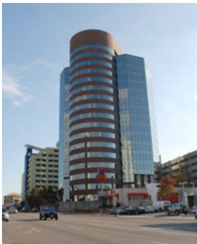
Palmer Plaza Building view from West End

http://www.wangvisioninstitute.com/mapus.html